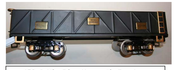
AF Bodied "Sand" Car with 20-194 "Coal" car plates. The example shown is repainted.