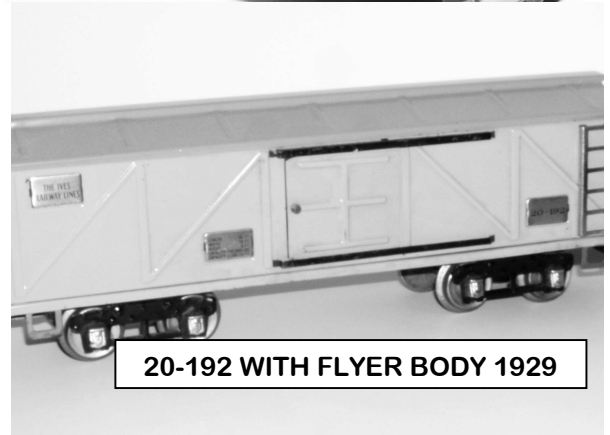
20-192 WITH FLYER BODY 1929