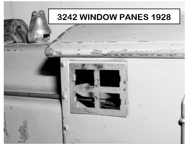
3242 WINDOW PANES 1928

This unique triangle of competing companies even produced some cars and accessories which boast major components from all three firms on the same piece. Unwittingly, the "Transition Period" (some IVES fans insist on the word "Occupation"!) created many of the most beautiful and sought-after trains ever produced in America. Most are also exceedingly rare; a result of low production across very short periods of time.