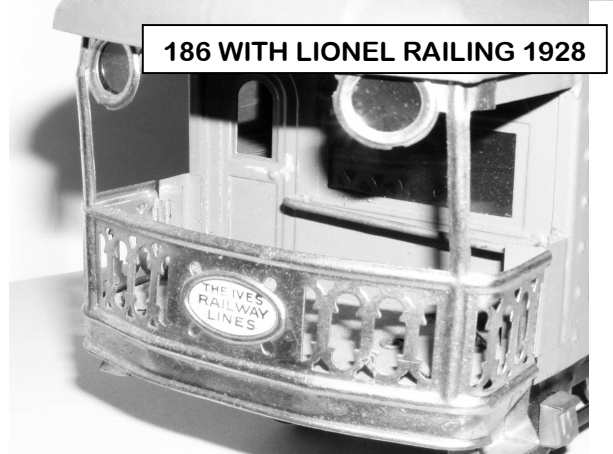
186 WITH LIONEL RAILING 1928