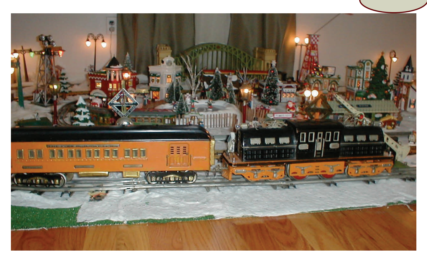
Christmas Layouts by IVES